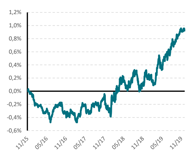
Exhibit 1: Cumulative excess return of AXA IM's exclusions on MSCI ACWI from 30 Nov 2015 to 31 Dec 2019