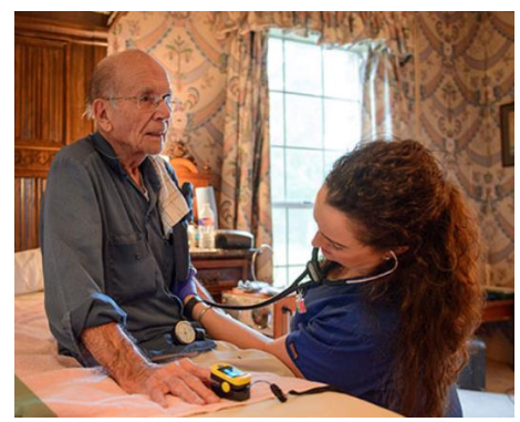
Providing home health assistance to senior

Amedisys is a healthcare at home provider delivering personalised home health, hospice and personal care services. Amedisys scope of activities include compassionate healthcare to help patients recover from surgery or illness, support for those who are dealing with a terminal illness or assistance with the essential activities of daily living. With the desire to avoid medical centre visits and an increasing number of seniors deciding to age at home rather than in senior care facilities, the demand for Home Health is likely to accelerate over the following years.