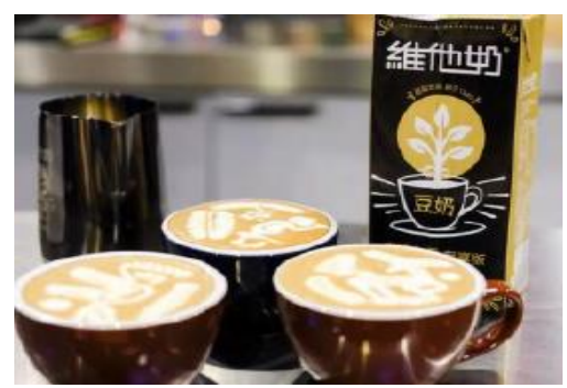
Vitasoy entering coffee shops with barista soymilks

Vitasoy is a manufacturer and distributor of plant-based food and beverages. The company is China and Hong Kong's largest soymilk player and a leader in the premium ready-to-drink (RTD) tea beverage market. Vitasoy stands out due to its strong branding and product positioning. The company should continue to benefit from a rising Chinese demand of the middle class who wants to adopt plant-based milks as an alternative to their dairy product consumption.