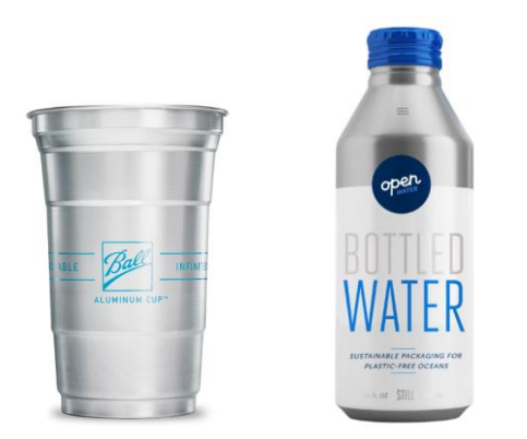
Ball's aluminium solutions to replace plastic cup and bottles

Ball is a supplier of innovative, sustainable aluminium packaging to the beverage, food, personal care and household products industries. The company major product line is aluminum and steel beverage cans/containers whilst it is also involved with aerosol and spacecraft products. The consumer awareness for plastic pollution is urging companies to create sustainable packaging alternatives. With the aluminium container – a fully and infinitely recyclable product – new solutions are emerging and offering growth opportunities for some of the best providers.